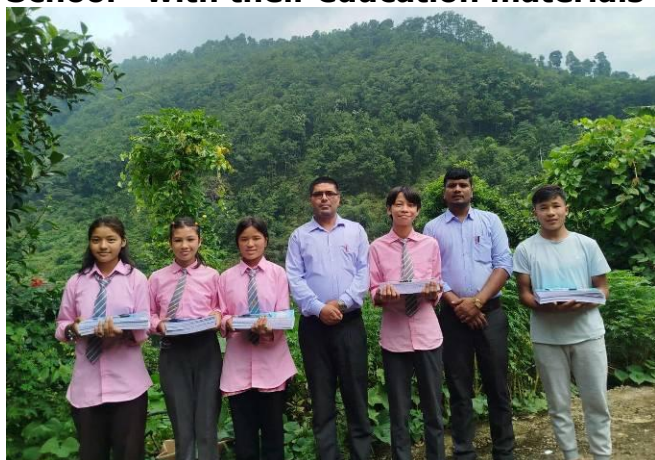
Above: Students of Rukmani Secondary School with their education materials