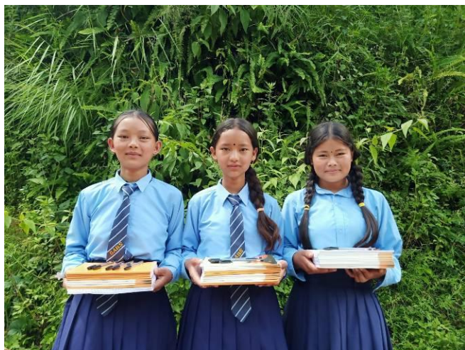
Above: Students of Arjun Secondary School with their education materials