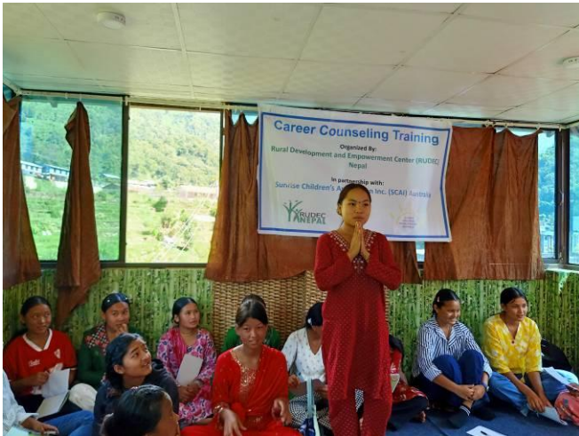
Above: Career Counselling