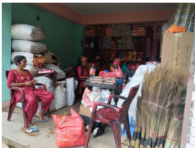
Above: Cooperative Collection and Selling Centre

This quarter, the Collection and Selling Centre, which links its farming members with the market, collected 105 kg of buckwheat, 5 mana of ghee, 100 brooms, 50 kg of beans, and 35 kg of peas , and sold them in the market. In addition, the Centre, located near the well-known "Dupcheshwor" temple, continued selling pilgrims with worship items such as flowers and fruits.