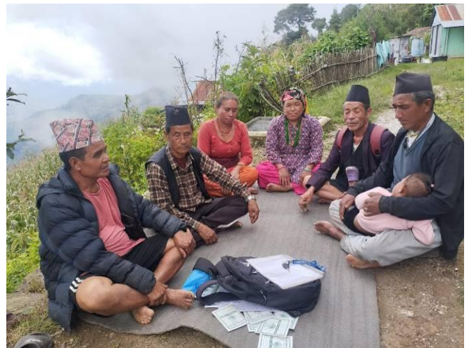
Above: Cooperative Meeting, Golfu Subgroup

The cooperative held its regular monthly meetings this quarter, where members met in sub-groups and deposited their savings as usual.