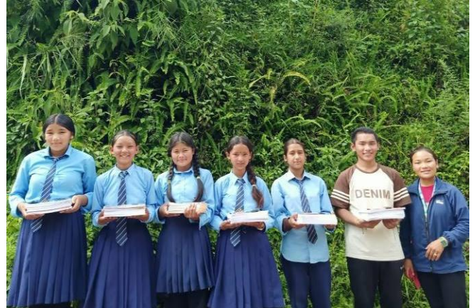
Above: Sponsored student of Kaukeshwori School with their education materials