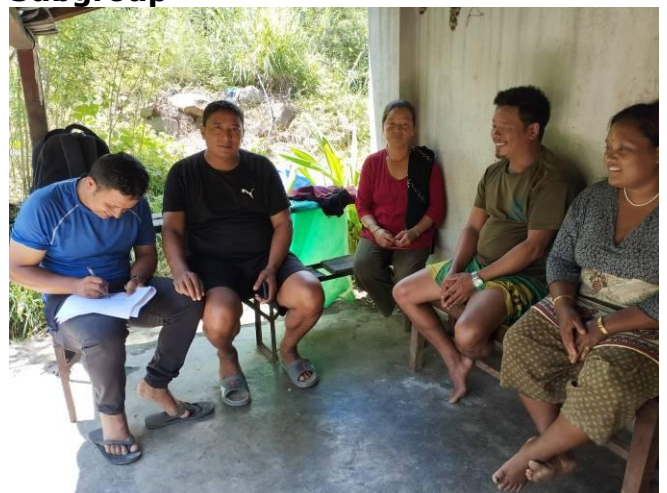
Above: Cooperative Meeting, kalyan Subgroup