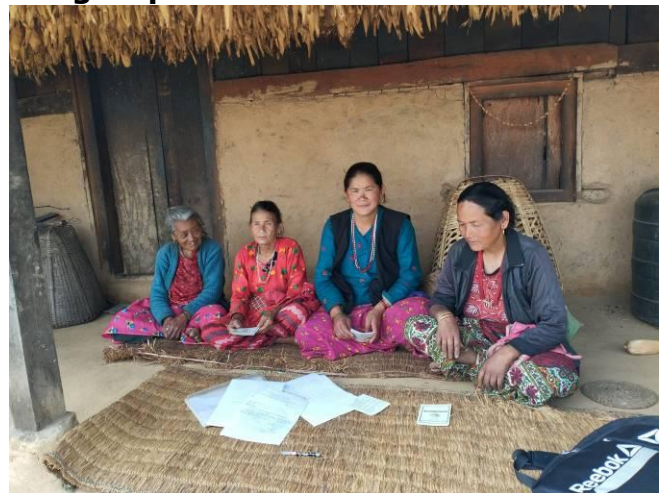
Above: Cooperative Meeting, Jimnang Subgroup