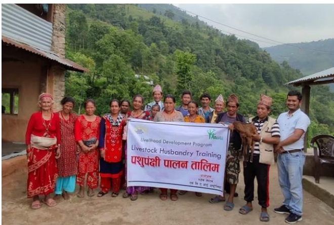
Above: Goat farming training for Bhumesthan saving group