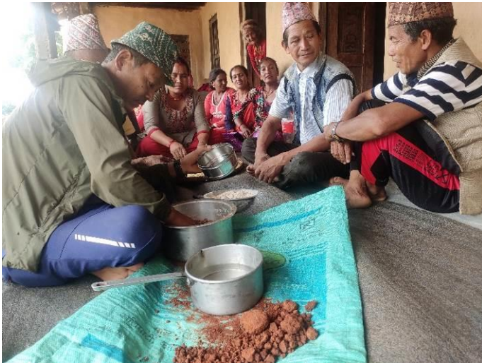
Above: Goat farming training for Bhumesthan saving group