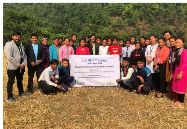
Above: Life Skill Training

Organized 2 days of life skill training for the youth. This training is intended to orient youth about basic life skill techniques such as efficient communication, making decisions, problem-solving etc.