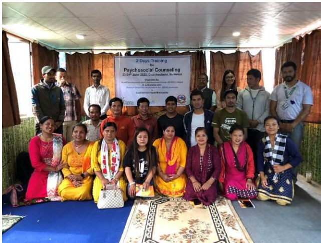
Above: Psychosocial Counselling Training

Organized two days of "Psychosocial Counselling" training for community school teachers. The objective of the training was to enable teachers to identify symptoms of psychosocial issues among school children and extend emotional care accordingly.