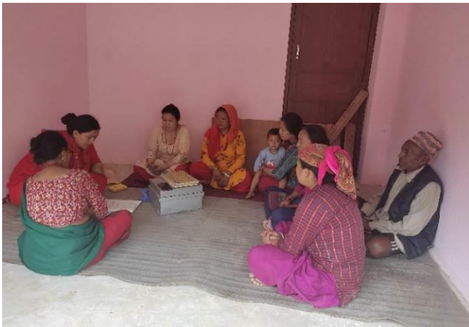
Above: Sangini Savings Group Meeting