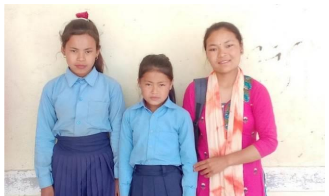
Above: Bhumisthan L.S. School Visit