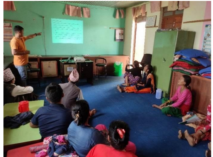
Above: Pre-Cooperative orientation for Udayjalpa saving groups