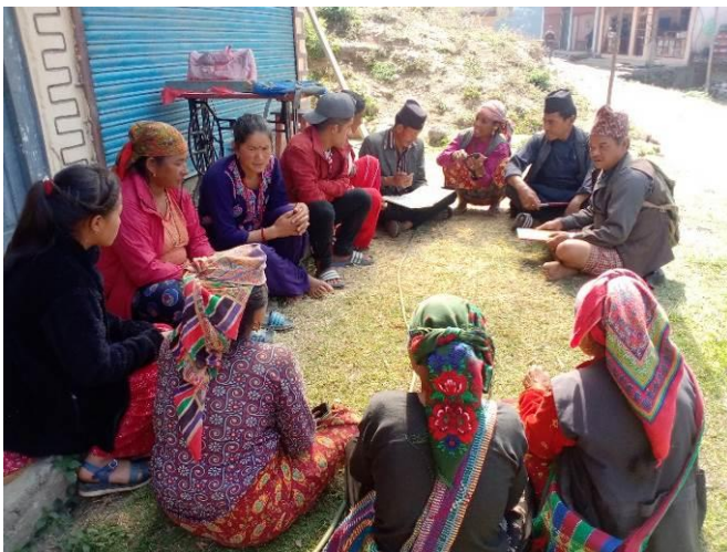
Above: Kaukeshowri Saving Group Meeting

This quarter our team organized 30 savings group meetings . Members of the savings groups are attending monthly meetings and making monthly deposits as usual.