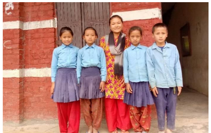
Above: Arjun Lower Secondary School Visit

This quarter our team organized 41 school Visits to monitor the performance and regularity of our sponsored children. We also met teachers and get their suggestions for the improvement of the children we support.