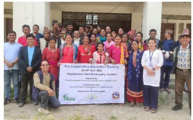
Above: Pre-Cooperative Education Training