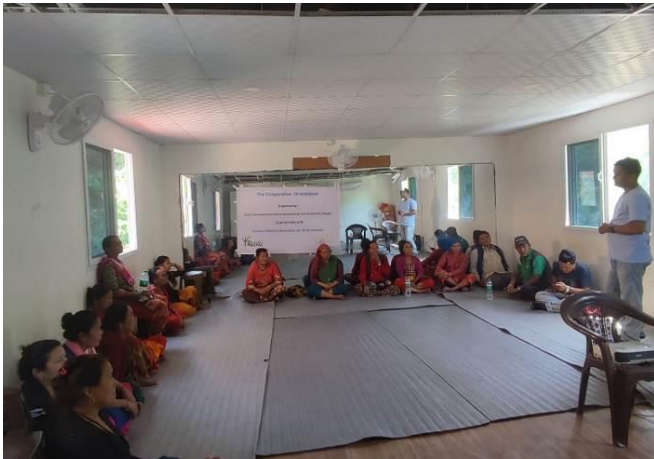
Above: Pre-Cooperative orientation for Sangini saving groups.