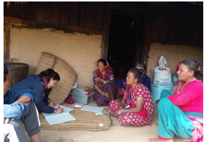
Above: Jimnang Savings Group Meeting