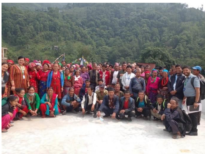
Above: Pre-Cooperative General Meeting

The meeting was also attended by the representative of the office of RM.