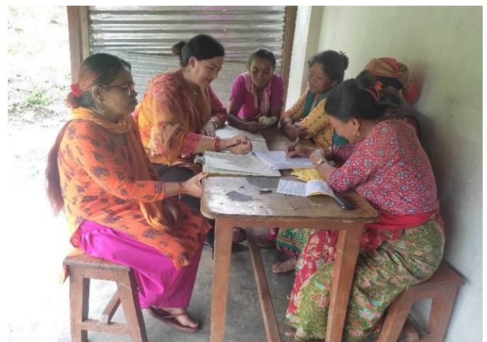
Above: Kalyan Savings Group Meeting