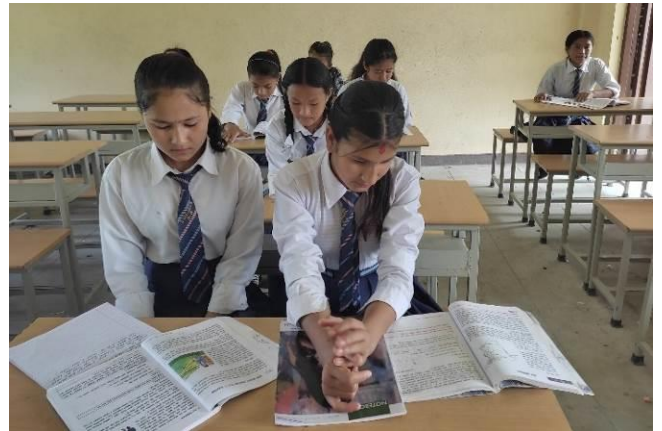
Above: Rukmani School Visit