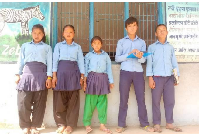
Above: Rukmani School Visit

We provided copies, pencils, pens, refills, trousers, and calculators to 131 of 147 students this quarter.