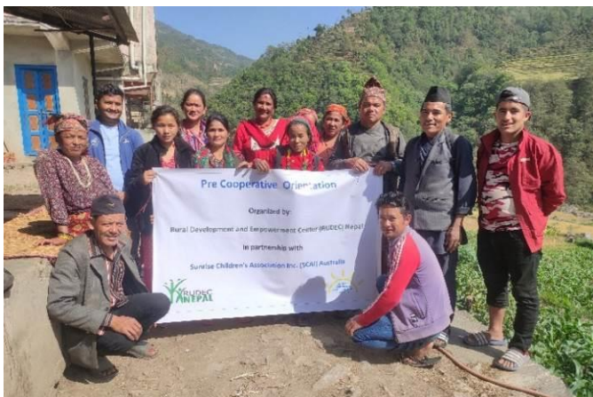
Above: Pre-Cooperative orientation for Kaukeshwori and Sanogolfu saving groups

Organized "Two Day Pre-Cooperative Education Training" for the key committee members of all saving groups at Ramati, Dupcheshwor. This training was organized in conjunction with the office of the Rural Municipality-Dupcheshwor. This training was facilitated by Dupcheswor RM cooperative department head. The training highlighted the legal provision of the cooperative registration process, RM guidelines and policies and compliance provisions in this regard.