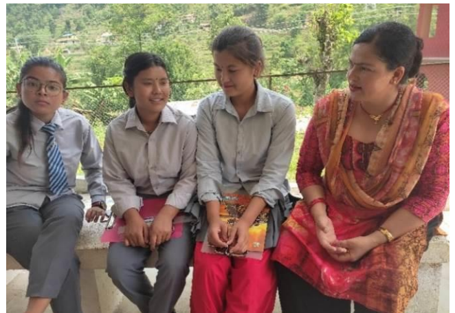
Above: Kalyan School Visit

We provided copies, pencils, pens, refills, trousers, and calculators to 131 of 147 students this quarter.