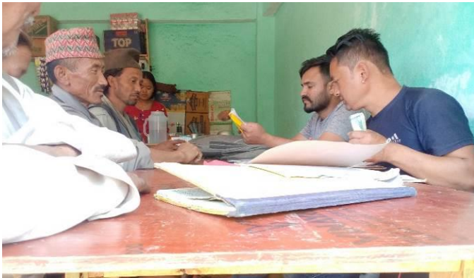
Above: Bhumisthan Savings Group Meeting