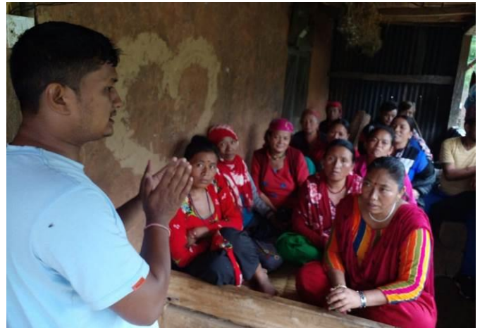
Above: Goat farming training for Dupcheswor saving group with SCAI's Livelihood Development Officer.