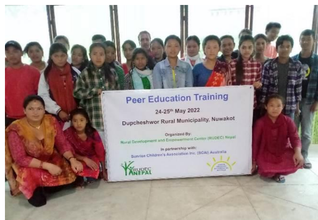
Above: Peer Education Training

Organized two days of peer education training for youth and adolescents this quarter, with a focus on girls class 8-10 . The training was intended to sensitize youth about reproductive health, identifying issues among peers and extend psychosocial support as and when required.