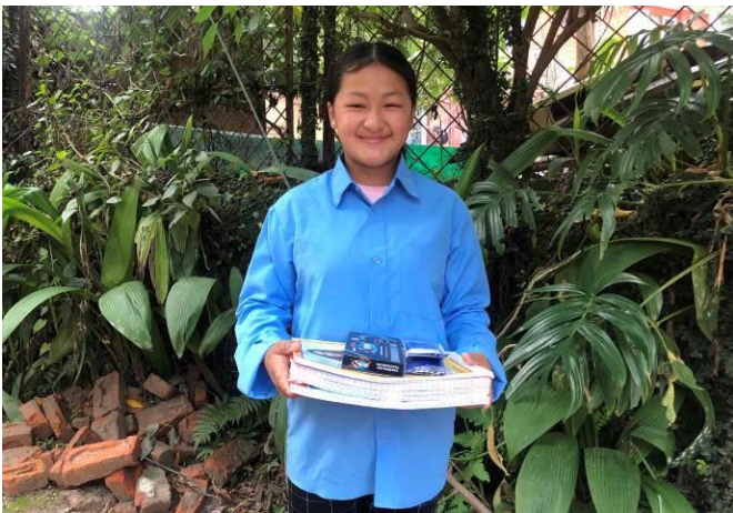
Above: School material distribution

We are thrilled to share that several of our sponsored children did very well during the final annual exams!