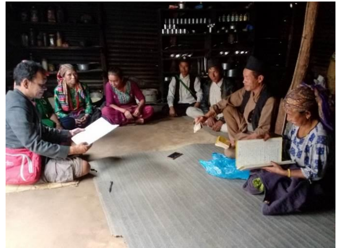
Above: Golfu Bhanjyang Savings Group Meeting

This quarter our team organized 30 savings group meetings . Members of the savings groups are attending monthly meetings and making monthly deposits as usual.