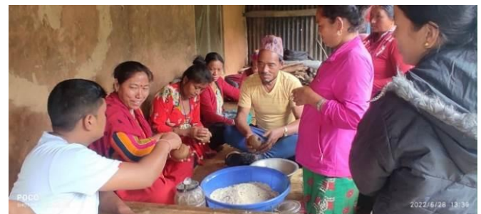
Above: Goat farming training for Dupcheswor saving group