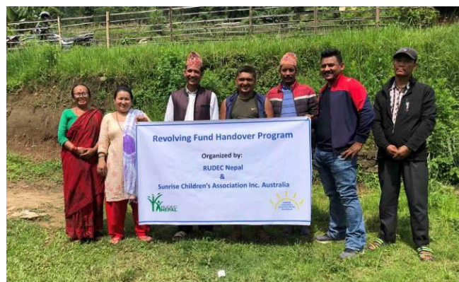
Above: Revolving fund Handover program

We also provided the final instalment of the revolving fund to our saving group members this quarter.