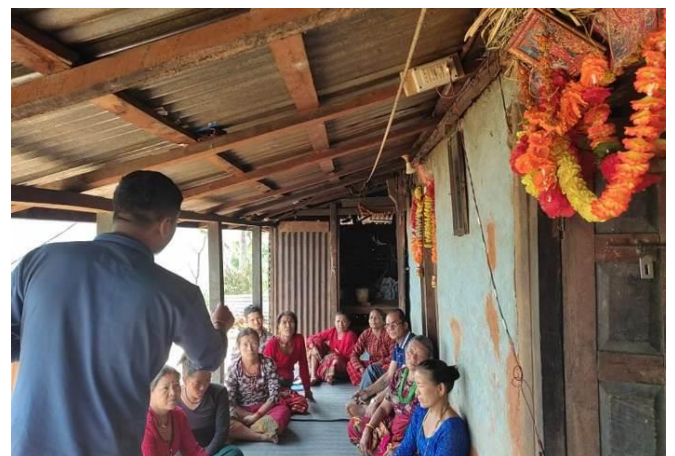
Above: Pre-Cooperative orientation for Mangala saving group