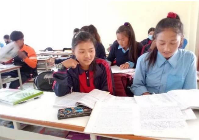
Above: Golfubhanjyang School Visit