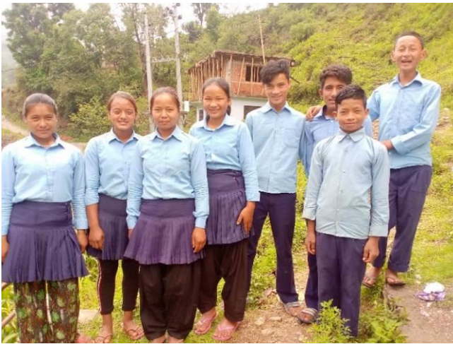
Above: Kaukeshwori School Visit