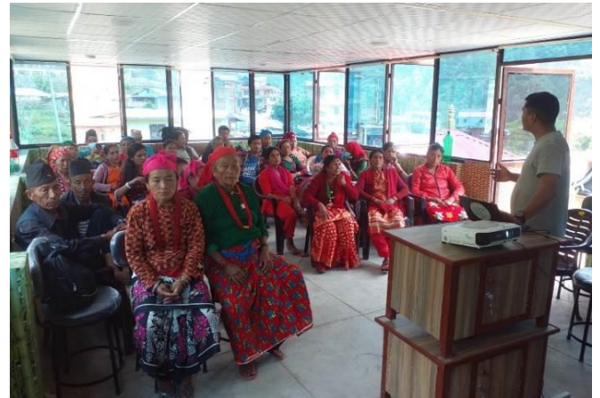
Above: Pre-Cooperative orientation for Dupcheshwor and Badhsala saving groups

Seven pre-cooperative orientations were organized this quarter. These orientations are intended to sensitize saving group members about cooperative education, the legal process of cooperative registration and opportunities with the cooperative.