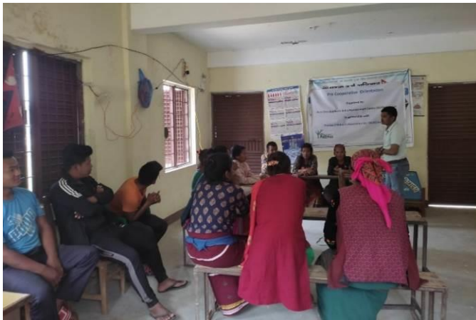
Above: Pre-Cooperative orientation for Jimnang and Ninagale saving groups