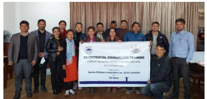
Above and below: Some of the glimpses of the capacity building trainings

As part of our ongoing plan to build the capacity of our SCAI and NGO teams, we organized 2 day Psychosocial Counselling Training this quarter as part of an annual refresher, one in Nuwakot and one in Kathmandu. Staff and key Board members from our 3 NGO partners and our SCAI Nepal staff attended the training.