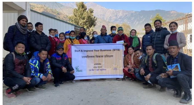
Above and below: SIYB Training

Vegetable and livestock farming training continues to be one of the most lucrative as well as safe options for small business in our project areas and builds on families existing knowledge and skills. The team organized these trainings after collecting business plans, following previous small business trainings. The series of livelihood interventions is helping several families towards a more stable and sustainable future.