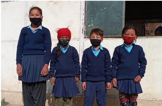
Above: Arjun School visit