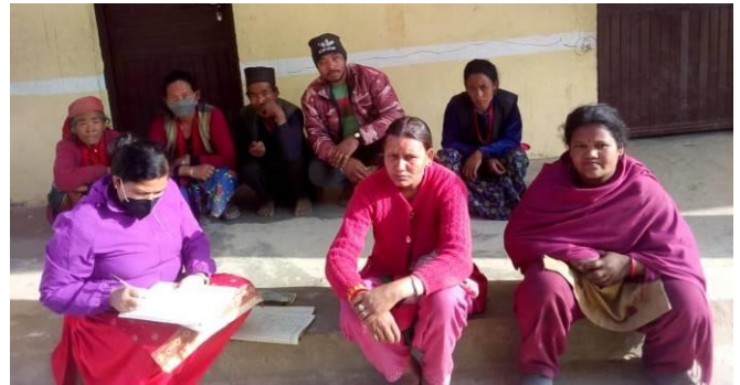
Above: Monthly meeting of Jimnang Savings Group

Vegetable and livestock farming training continues to be one of the most lucrative as well as safe options for small business in our project areas and builds on families existing knowledge and skills. The team organized these trainings after collecting business plans, following previous small business trainings. The series of livelihood interventions is helping several families towards a more stable and sustainable future.