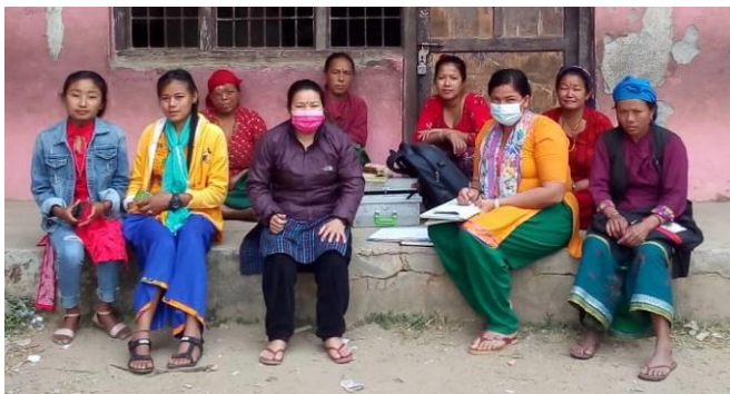
Above and below: Monthly meeting of Sangini Savings Group