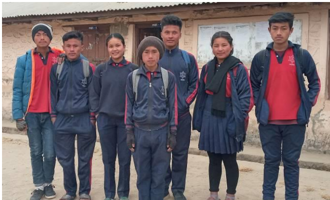
Above: Meeting 10 th grade students of Golphubhanjyang School