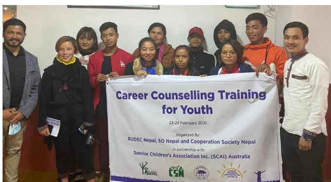
Above and below: Photos from the training