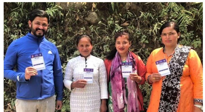
Above: Our field team immunized with the first dose of COVID19 vaccine

With positive cases continuing to rise in Nepal and far fewer social distancing measures being implemented by the government, we are thrilled that our field team had the opportunity to be vaccinated against the Covid-19 virus.