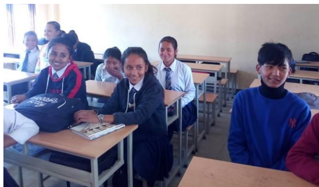
Above: Sundaradevi School visit

Students sat their 1 st term exams in mid-March . The school year has been extended from March to June, so final term exams will be held in June 2021.