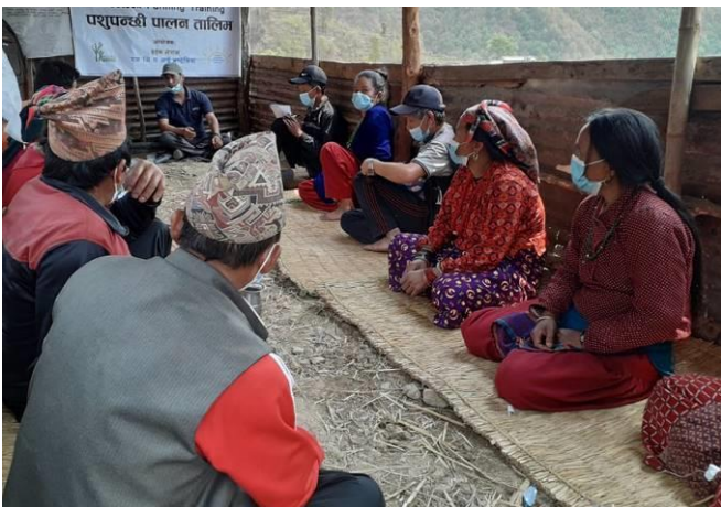
Above: Livestock Farming Training

This quarter 18 more families took loans from their local savings group to improve their livelihoods.