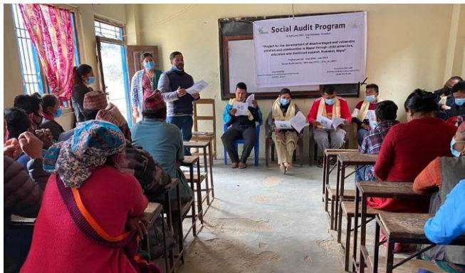
Above and below: Some of the glimpses of the social audit

The annual social audit was also successfully conducted with our teams presenting the financial and activity reports in the presence of the Deputy Mayor of Dupcheshwor rural municipality, program beneficiaries including students and their guardians and school teachers.