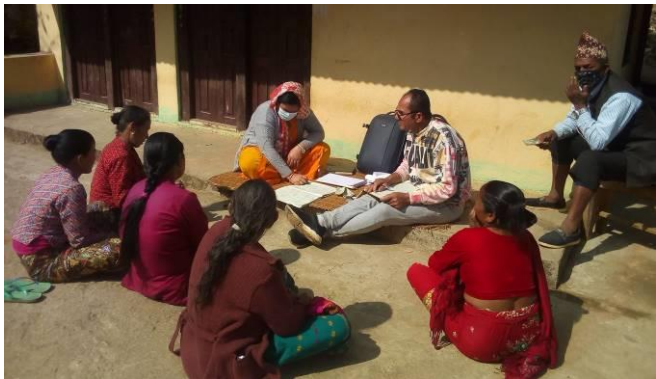
Above: Monthly meeting of Uday Jalpa Savings Group (Bhumesthan)