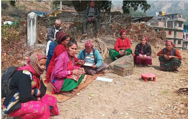
Above: Monthly meeting of Kaukeshwori Savings Group