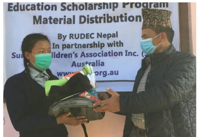
Above and below: Glimpses of scholarship materials distribution