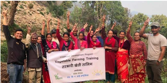
Above: Vegetable Farming Training