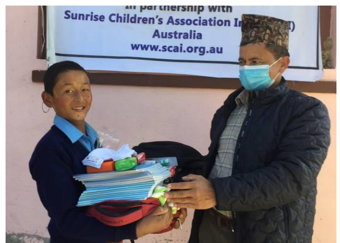
Above and below: Glimpses of scholarship materials distribution

This quarter we provided the sponsored students school copies (notebooks), stationeries, bag, shirt, sweater, shoes, stockings, socks and hygienic kits.