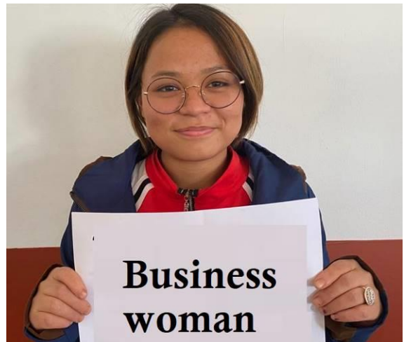
Above and below: Some of the graduates with their future ambitions

Total 40+ youth from our 3 different partner NGOs participated in this valuable training.