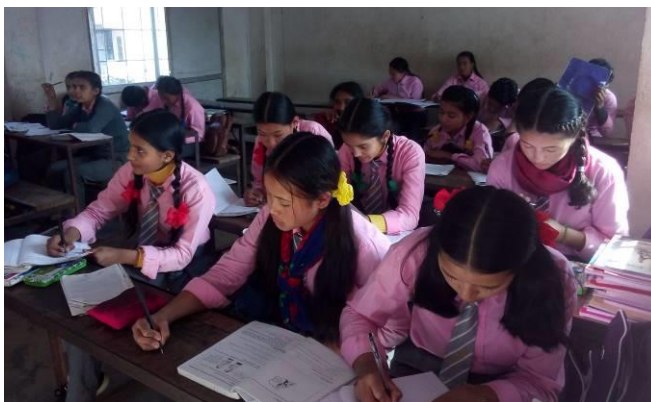
Above: Rukmeni School visit

This quarter we provided the sponsored students school copies (notebooks), stationeries, bag, shirt, sweater, shoes, stockings, socks and hygienic kits.